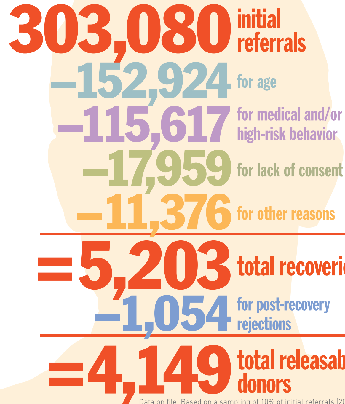
Data on file. Based on a sampling of 10% of initial referrals (2009)

Of course, if you have any questions about what we do, or how we do it, just contact your MTF representative.