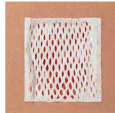
Placement with expansion