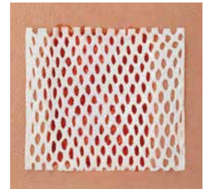
Incorrect placement - SomaGen Meshed extends too far past the edge of the wound