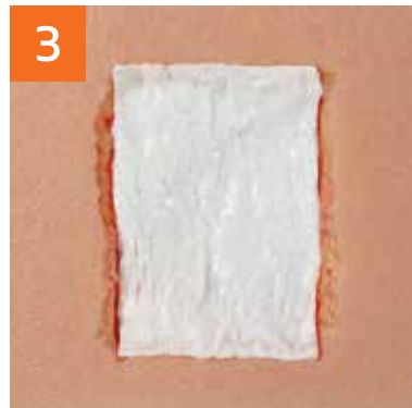
Placement without expansion

Apply graft on wound in a single layer ensuring no folds. Ensure maximal wound bed contact and tension-free fixation.